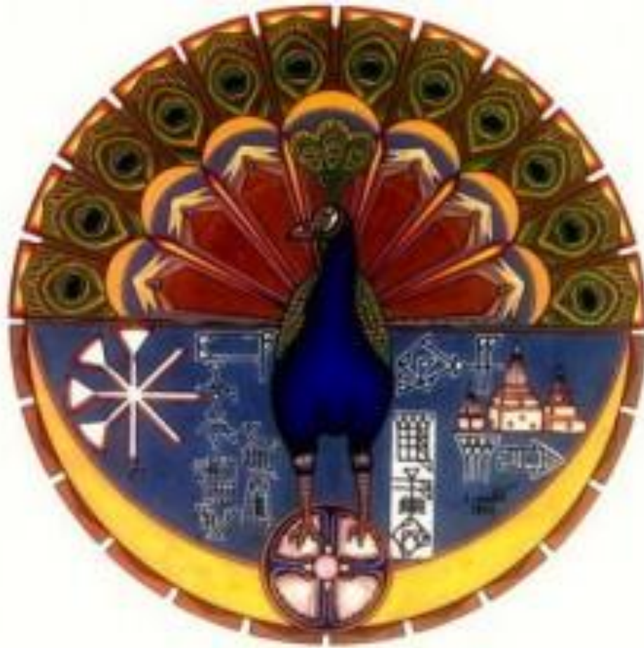
The image of Malaki-Taus – angel-peacock

One of the most disputed issues is what kind of people are professing Yezidism as a religion? Are they a part of the Kurds, identifying themselves as "Yezidis" by religion or are the "Yezidis" an