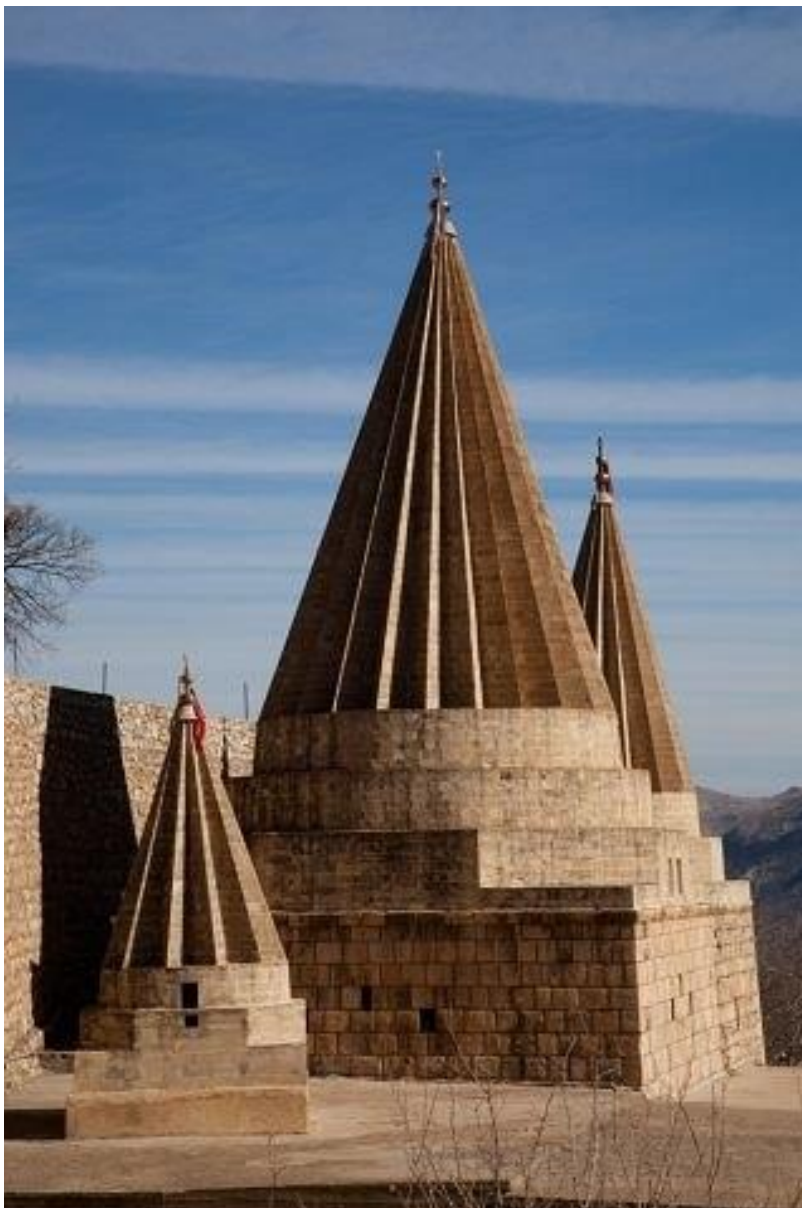
The Temple in Lalish