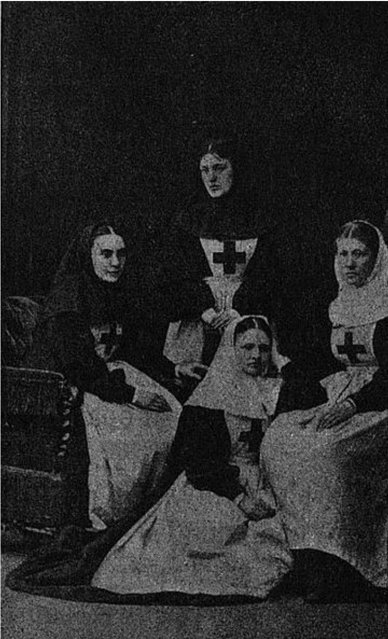
The nurses from Gabrovo hospital

territory. After the democratic changes in Russia the female memoirs about the Russian – Ottoman War are again silenced – they are not issued, not made popular by art, not included in the school textbooks only specialists of the War episodically mention them as illustration of certain thesis related to the national narrative of the War. These memoirs have never been object of separate research.