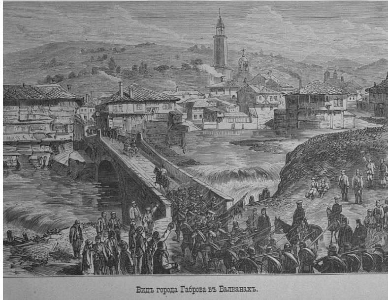
Meeting the Russian soldiers in Gabrovo (Альбом Русско-турецкой войны в европейской Турции 1877-1878, Санкт Петербург, 1881)