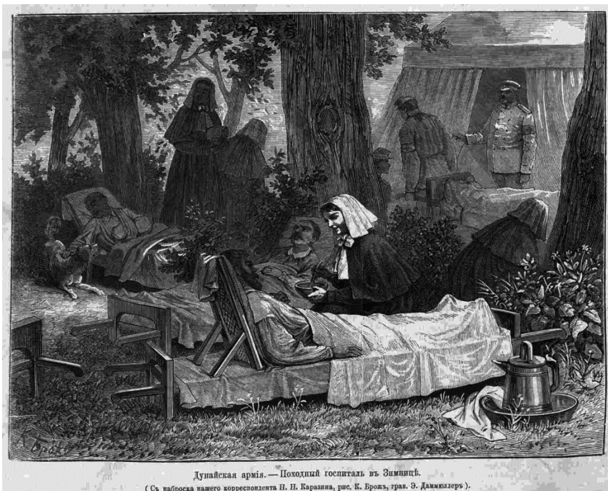
Field hospital in Zimnitsa (Hronika)