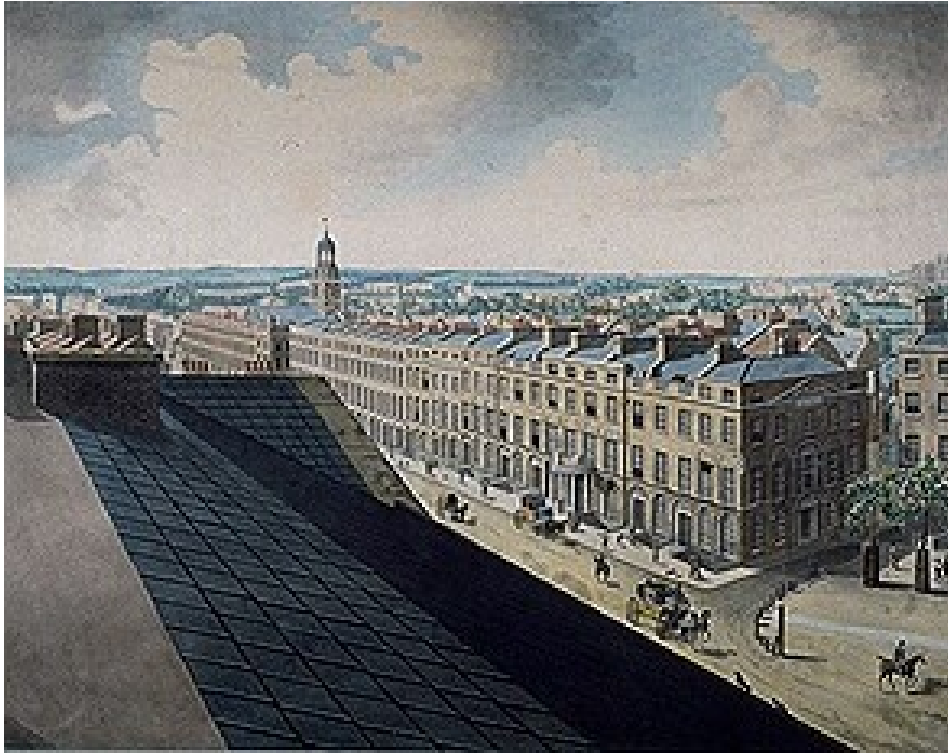
Frederick Birnie, Aquatint after Robert Barker's Panorama of London, 1792

During the course of the 19th century most often topics of the paintings were landscapes, Bible scenes, famous battles especially during the Napoleon wars when panoramas represented scenes from the battles of the Emperor (the panorama of the battle of Waterloo in 1816). In 1810, for instance, Napoleon visited the panorama rotunda in Paris. Leaving the exhibition he recommended 8 panoramas to be made to represent the most important victorious battles.