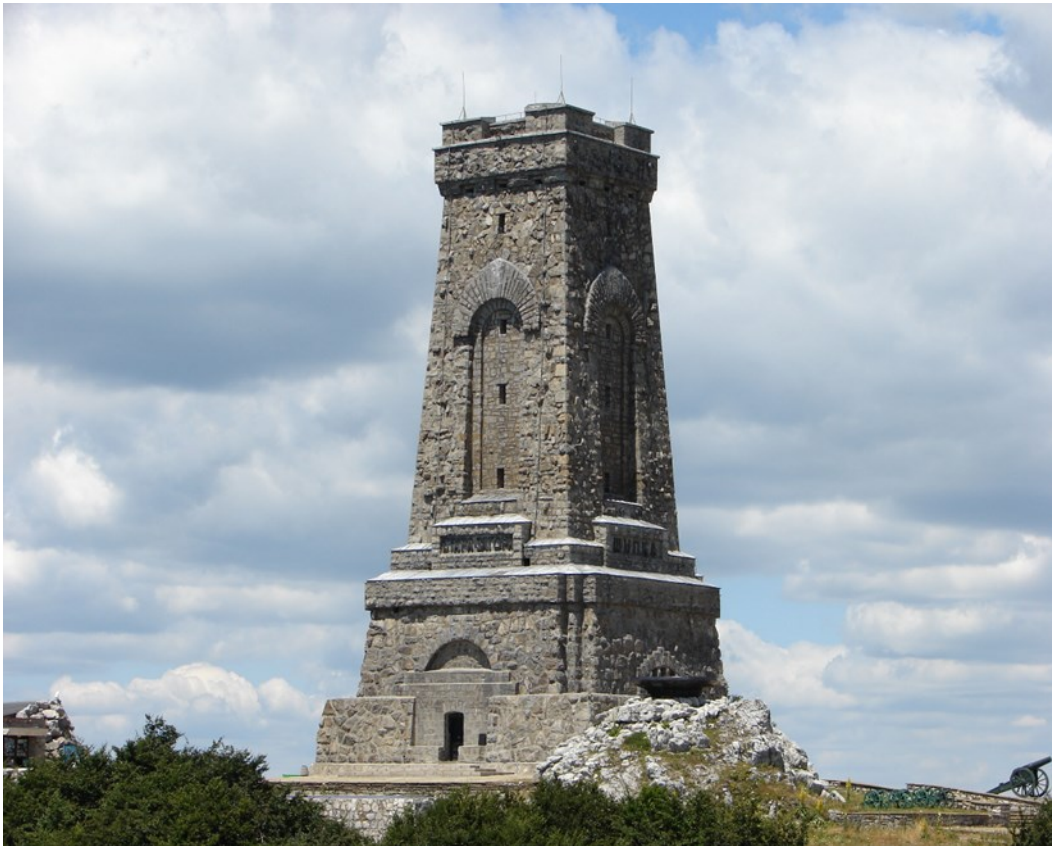
Šipka Monument, Bulgaria

In theoretical memory studies, monument is considered as both collective creation of identity and affirmation of interpretation of history by consensus between the state and its citizens. Each monument is socially and politically motivated and objectifies social constellations. It is a social symbol uniting a group or a nation making a collective memory visible and objective. Once created monuments immediately shape public space and projects long term consequences. The lack of monuments in a certain period of