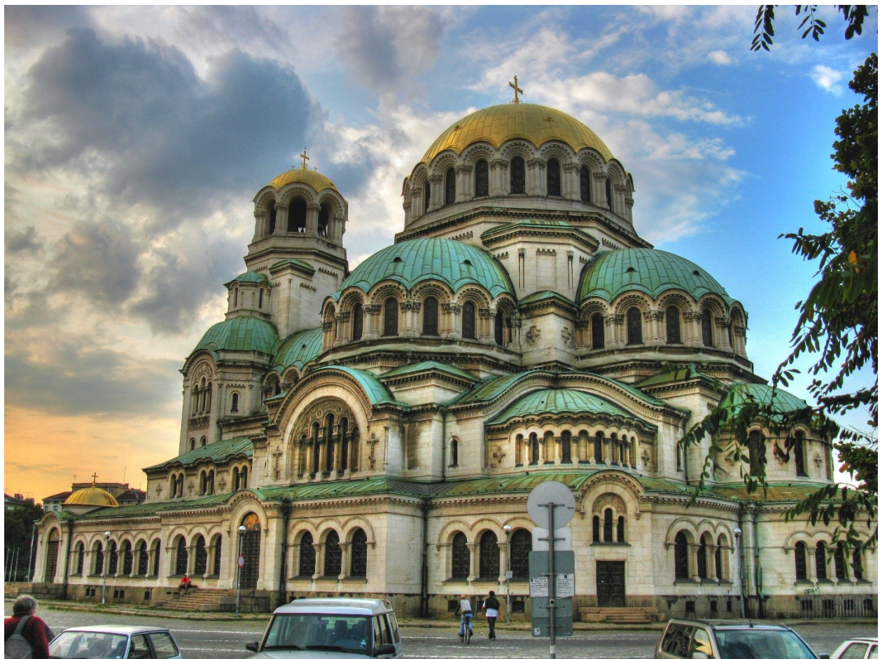
The Church Monument Alexander Nevsky - Bulgaria

The history of the first Russian monuments devoted to the Russo-Ottoman War re-veals the lack of any Bulgarian tradition of memorial culture in the first decades after the War. The initial memorial places were imported from outside, from the victorious Russian Empire, and were marked by the tradition of the Russian religious memory culture. Depending on the Bulgarian-Russian and later on the Bulgarian-Soviet relations the monuments changed their meaning and function; their status was reinterpreted in accordance to the political situation. In spite of the drastic political changes in Bulgaria, the monuments of the last Russo-Ottoman War were not destroyed as it happened in the Soviet Union but rather different aspects of historical memory were emphasized and celebrated in the cultural memory, while some aspects of memory were doomed to silence and new aspects were invented.