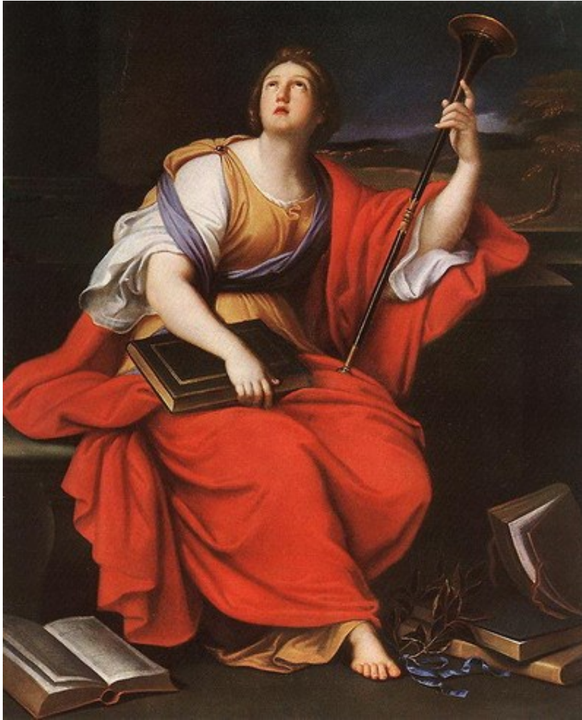
The Muse Clio (1689). By Pierre Mignard

With the rise and successful completion of the nationalistic movements in the Central and West Europe by the end of 19th century the role of the museums increased. This is the time when national museums opened in most of the national countries. Step by step museums turned into a powerful tool for constructing and consolidating the national identities because of the potential to visualize the story of the nation, its origin, myths and symbols by the exposure of objects arranged on chronological or systematic way.