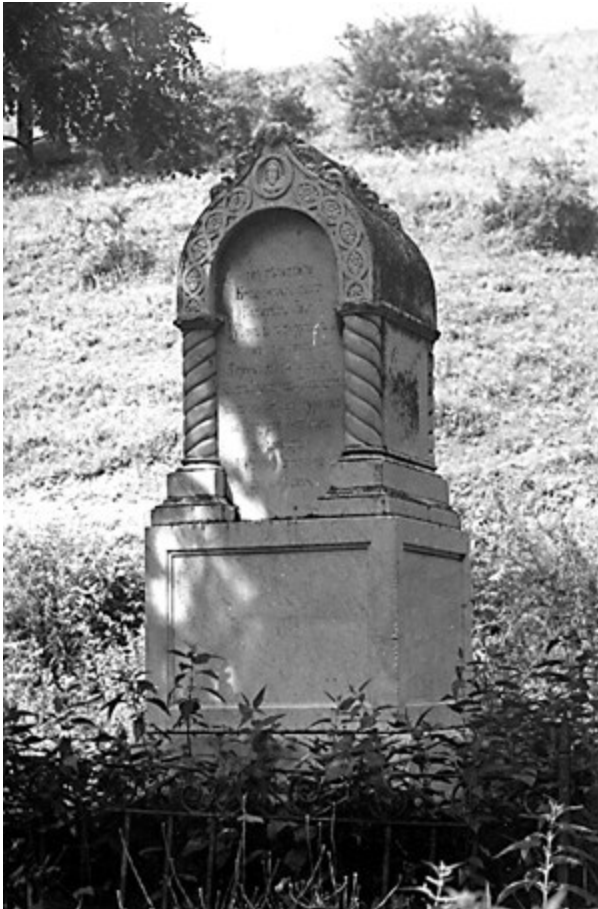
Grave Monument - Bulgaria

history speaks about identity crises and a related disintegration of the state or about a lack of tradition in objectifying the cultural memory of the nation.