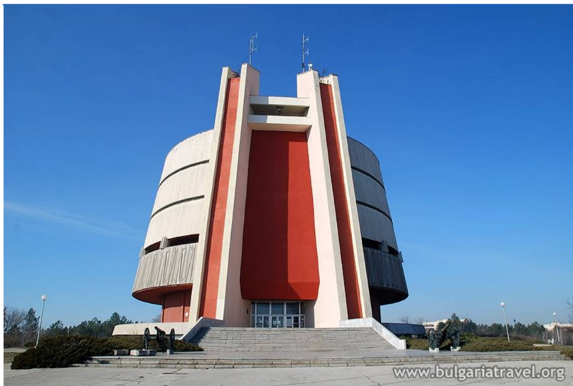
Panorama "The Epopee of Plevna 1877"