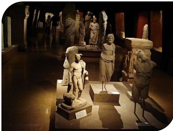
Istanbul Archaeological Museum

In the museum object, images and texts related to certain époque or sphere are collected, stored and exhibit. Aside of the traditional museums presenting paintings, historical and archeological monuments museums of almost everything exist – museum of transport, museum of wine, museum of childhood. The common feature of all museums is that they are meant for exposure.